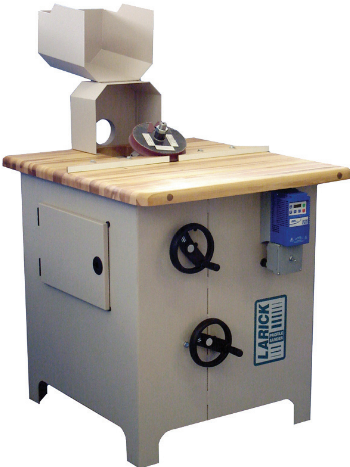
MODEL 361, 362, 364